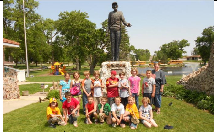
The 3 rd Grade at the Grotto!

The AC-T Students collected money all year for new playground equipment and they raised $800.00! So far, they have purchased Soccer and Playground Balls, Hula Hoops, and a Hopscotch Board. The Student Council will decide in the fall how to spend the rest of the funds. Great job!