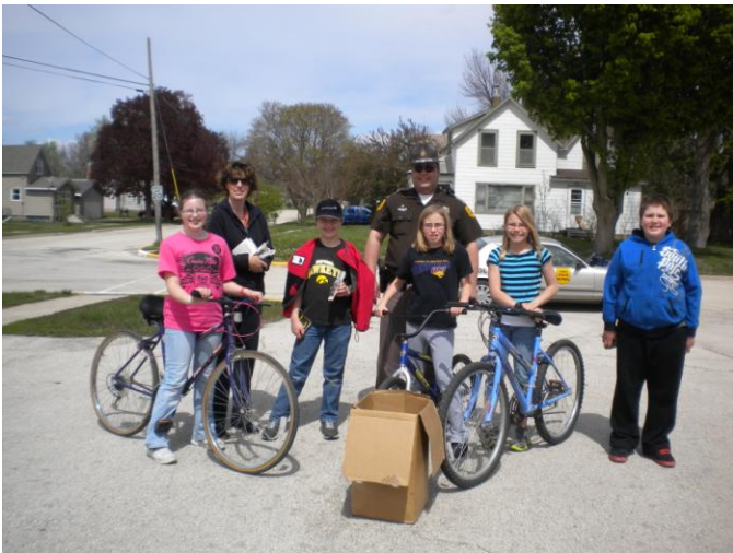
Bike Safety with the Iowa State Troopers!!