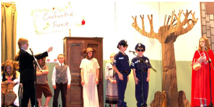
The 3 rd and 4 th grade plays!!