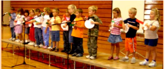
Kindergarten Class sings and plays "You are My Sunshine"

3<sup>rd</sup>/4<sup>th</sup> Grade performing for Grandparents' Day We had a celebration on September 16<sup>th</sup> because it was Grandparent's Day. Every class performed a special song, dance, or reading. A PowerPoint presentation was shown with the grandparents of AC-T students. The finale of the memorable afternoon was an All-Elementary Song of "God Bless the USA". Children found their grandparents and led them to the refreshment line and then to their rooms for special gifts. The AC-T Elementary wants to thank all who provided refreshments and all the grandparents who came to our program. We Love You Grandparents!