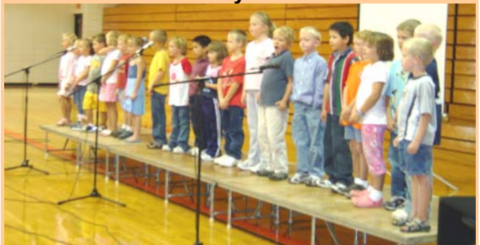
The 1<sup>st</sup> and 2<sup>nd</sup> Grade sings "Just for You"